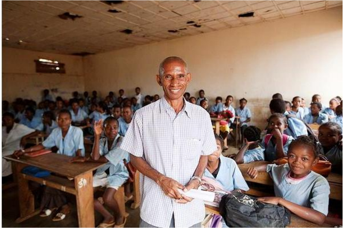
Diego Suarez School Site

Connecting communities across the world.